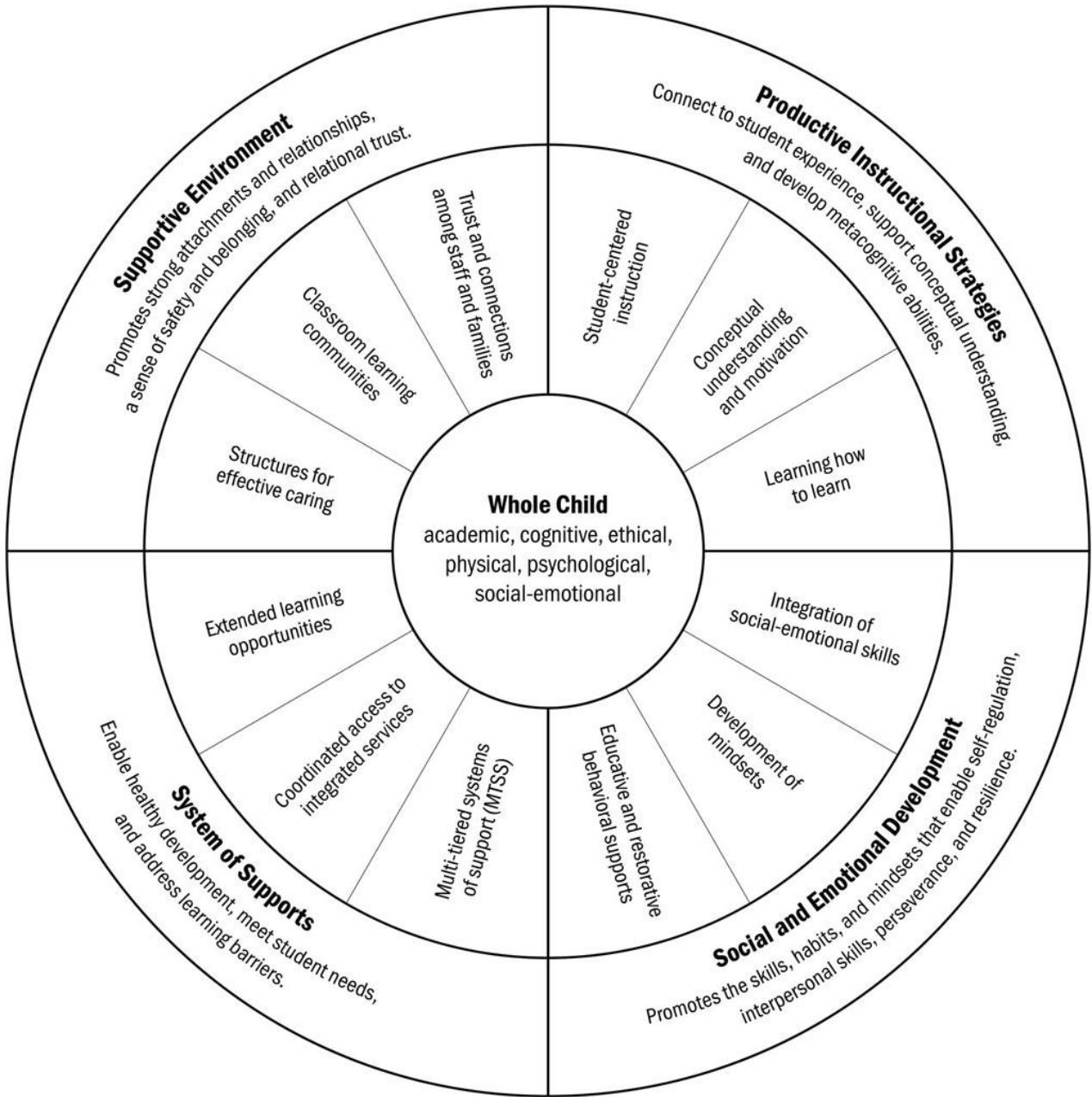
SOLD Principles of Practice (Darling-Hammond et.al, 2019)